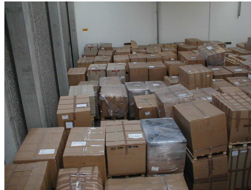
IOM cargo boxes waiting to be shipped to Baghdad

❖ Arranging transport of your cargo from Denmark to Iraq. You can take two cubic metre boxes per adult and one cubic metre box per child;