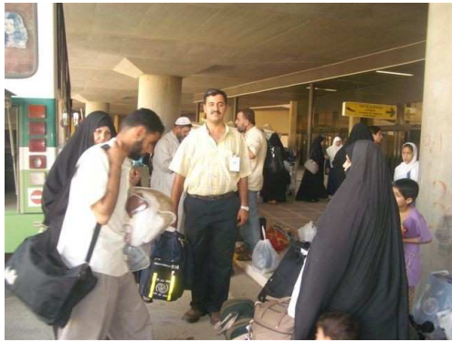
Returnees being assisted by IOM at Queen Alia Airport, Amman

❖ IOM is the leading international organization for migration. One of the ways we help migrants is by assisting those who want to return voluntarily to their country of origin (Assisted Voluntary Return, AVR).