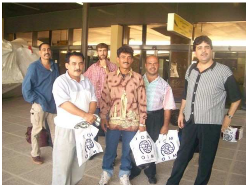
A group of Iraqi returnees at Queen Alia Airport, Amman