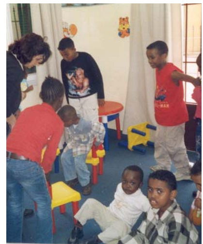
Clockwise from top: Various types of materials were distributed in participant's native language during cultural orientation in Beirut, 2004; Participants studying information material during cultural orientation in Beirut, 2005; Trainees were asked to write down their expectation about their new home country in Cairo, 2004 ; Children with the social worker during cultural orientation classes in Lebanon, 2004.