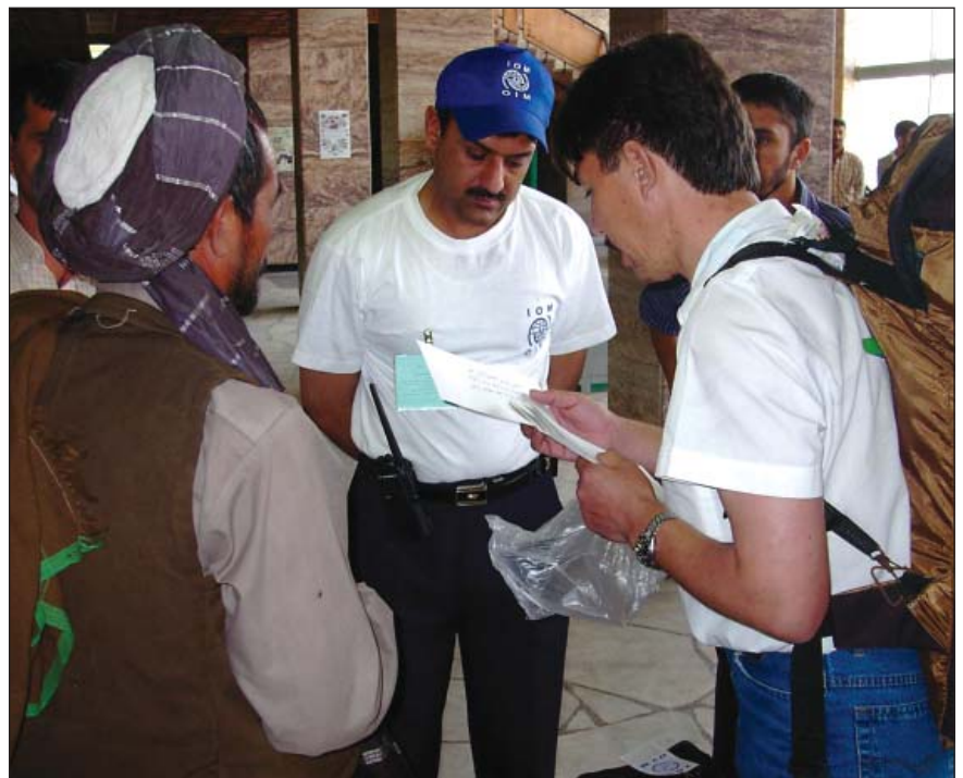
IOM assisting returnees at Kabul airport.

WORK TOWARDS EFFECTIVE RESPECT OF THE HUMAN DIGNITY AND WELL-BEING OF MIGRANTS.