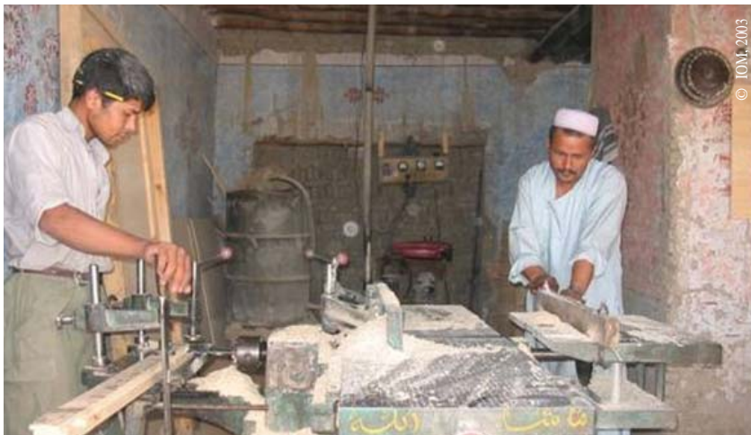
Taking advantage of one of RANA's practical courses on carpentry.

Training institutions are selected by the reintegration team, depending on returnees' needs and quality assessment. The training is paid for by RANA and accommodation is provided to beneficiaries for the duration of their course, if needed. Popular educational courses include information technology (IT) and English courses. Vocational courses are usually carried out through on-the-job-training.