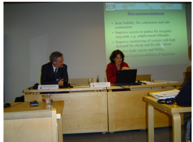
PIELAMI Conference in Helsinki

Donors: EC's Argo Programme, Finnish Ministry of Labour, IOM