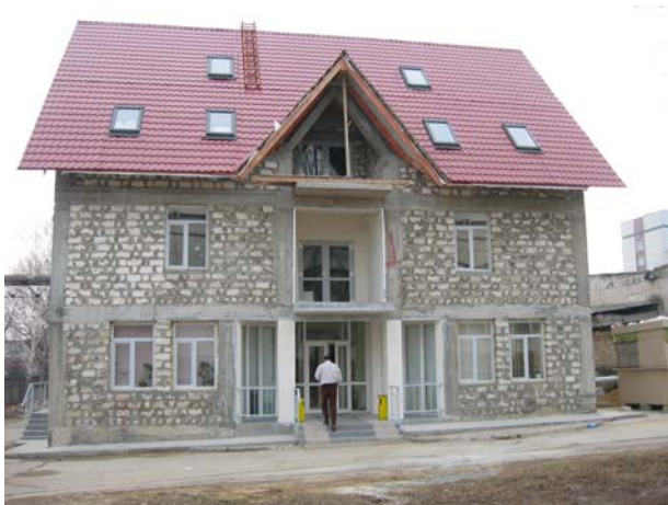
New Chisinau Rehabilitation Centre

become more engaged in the social protection, rehabilitation, and integration of trafficked persons.